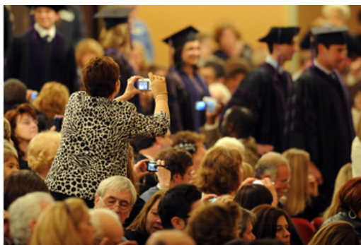
Friends and family take photos as University of Michigan

"Government roles are not for the faint of heart," she said. "Transformative change is very hard, but please don't settle for anything else."