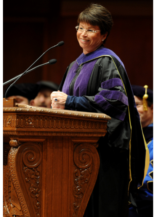
Valerie Jarrett speaks at Hill Auditorium on Saturday.