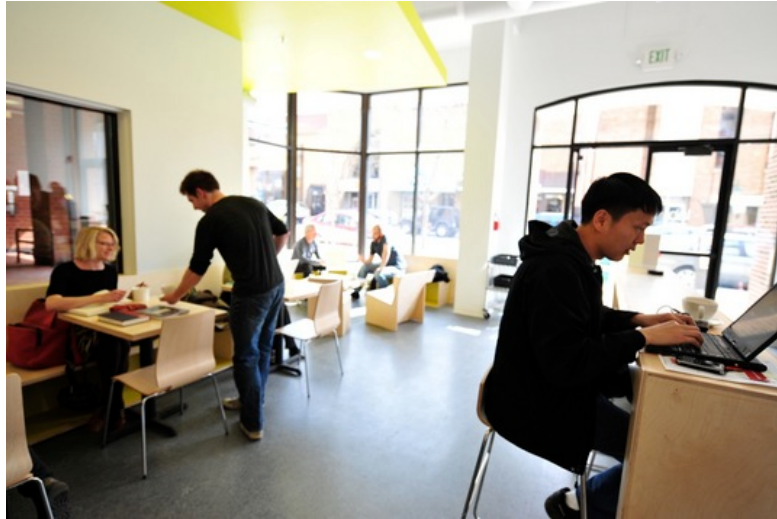
Patrons enjoy coffee, yogurt and free Wi-Fi at lab, which officially opened Tuesday in downtown Ann Arbor.