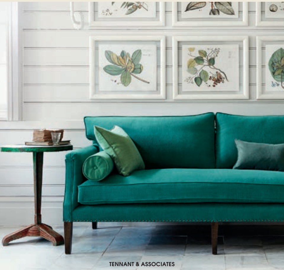
TENNANT & ASSOCIATES