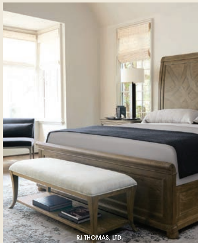
RJ THOMAS, LTD.

FURNITURE | FABRICS | WALLCOVERINGS | BEDDING | FLOORING | RUGS | LIGHTING | TILE | KITCHENS | ARTWORK | ACCENTS